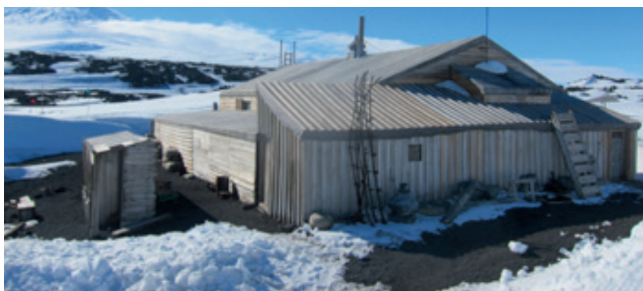
The location of Scott's hut in Antarctica today

They debated what should be done and decided that Shackleton's need was greater than theirs. They would not just sit tight and hope for rescue but would lay the depots as originally planned. Of course they did not know that Shackleton and his men had abandoned any hope of reaching, let alone crossing, the continent.