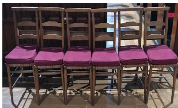
Prayer Chairs (6) and Chairs (2)