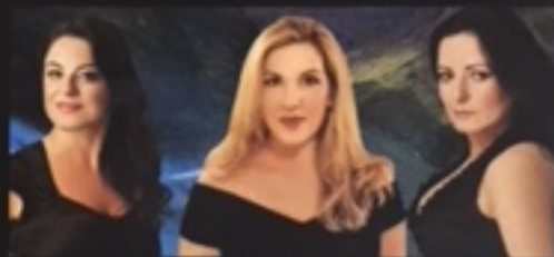
The Highland Divas

Tickets also available at the door from 7.30pm