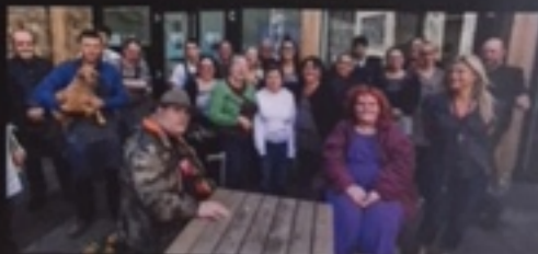
Grassmarket Community Project Choir

Sing The World is proud to be supporting: