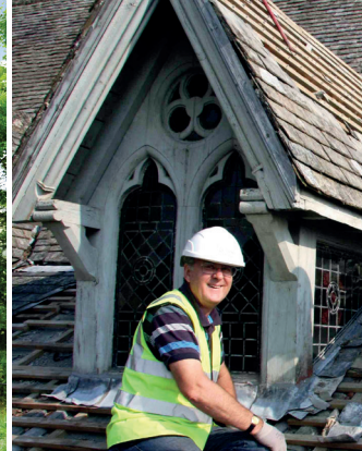
St Arvan's church, Monmouthshire