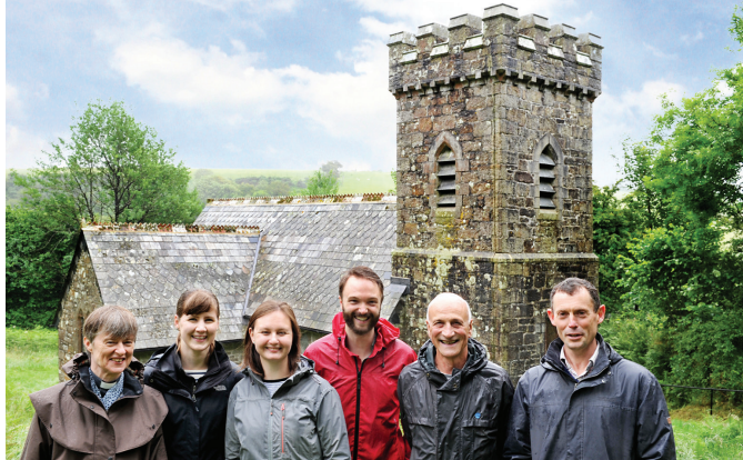
St Catherine's church, Temple, Cornwall