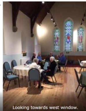
Looking towards west window.

St Ebba's, Eyemouth (only one-two hours from the other side of the Diocese) now has a very attractive light and airy space with a beautiful, warm atmosphere.