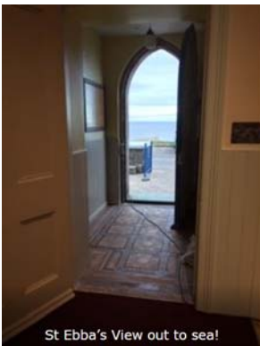
St Ebba's View out to sea!