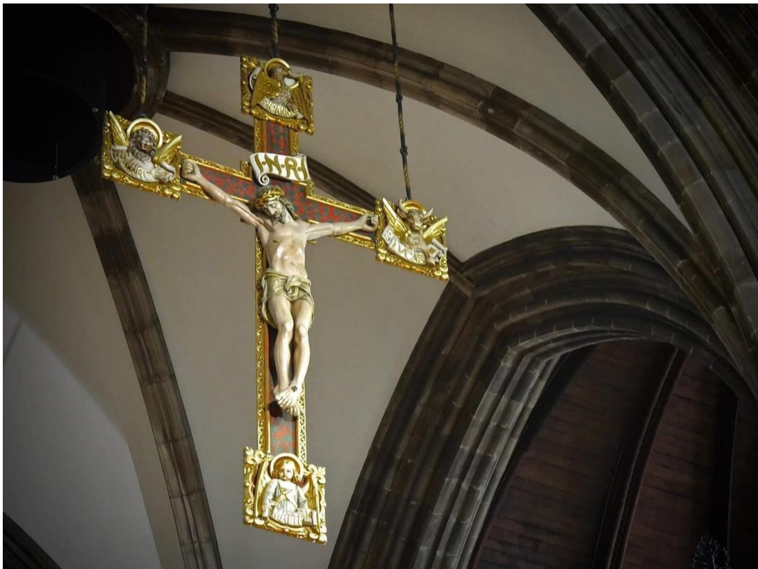
The Lorimer Rood in St Mary's Episcopal Cathedral

Christ crucified amid a field of red poppies