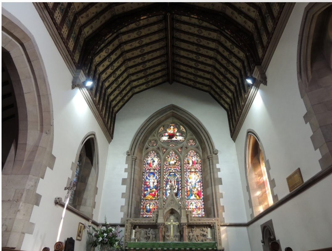
East Window and Reredos in St Andrew's Church, Kelso