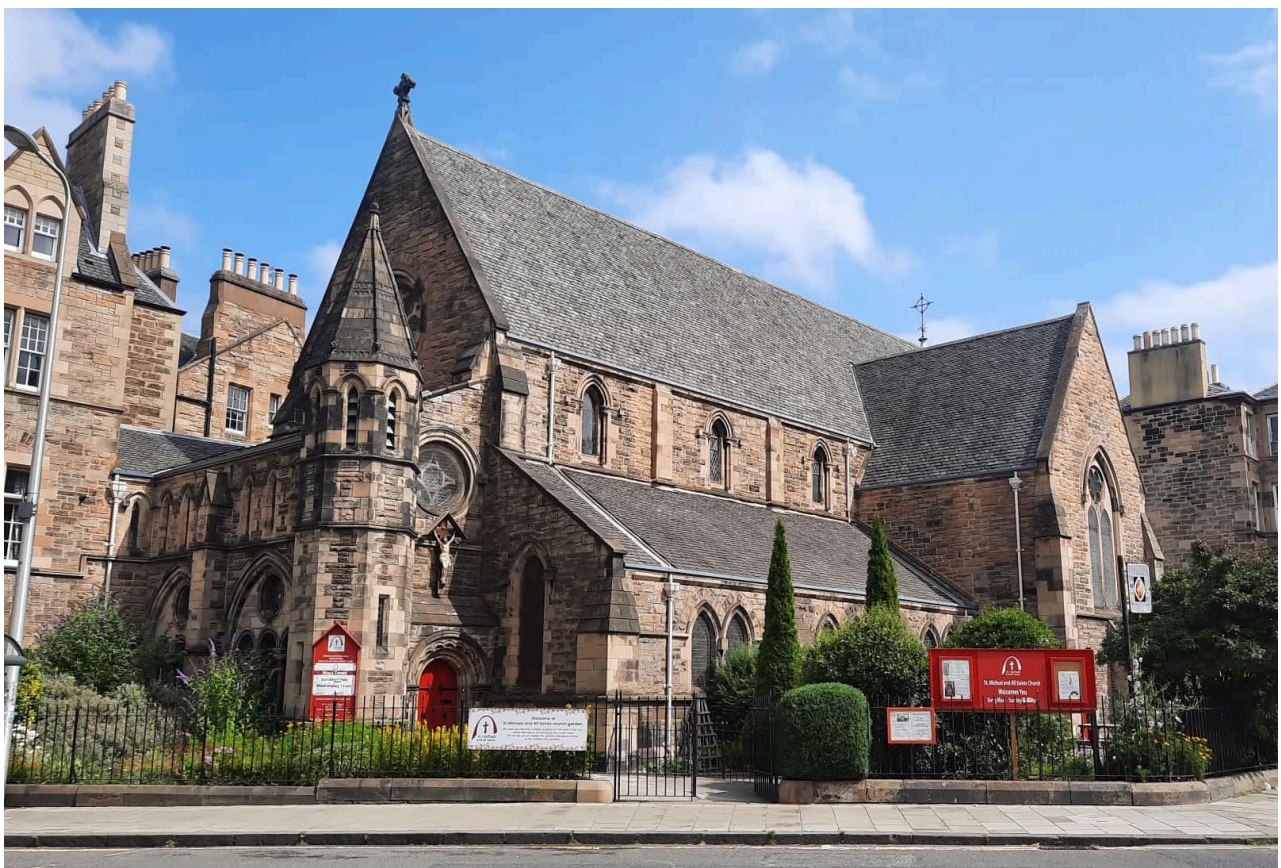
St Michael and All Saints' Episcopal Church, Edinburgh