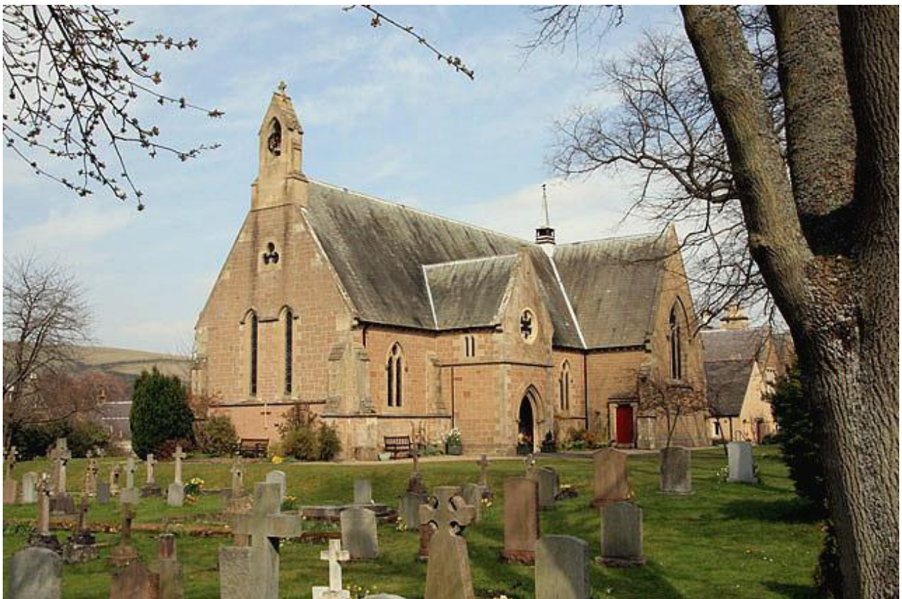
Holy Trinity, Melrose