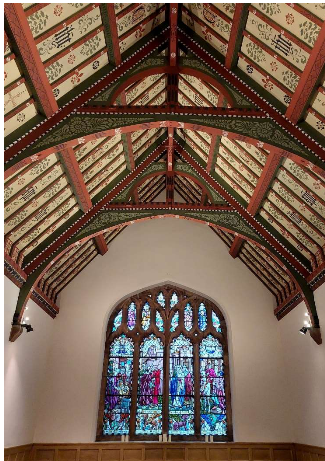
West Window of St Cuthbert's Church, Colinton, Edinburgh