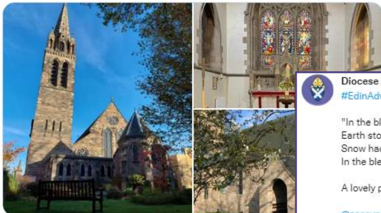
Scottish Episcopal Church and 9 others

Which of the 53 churches in our diocese is your favourite?