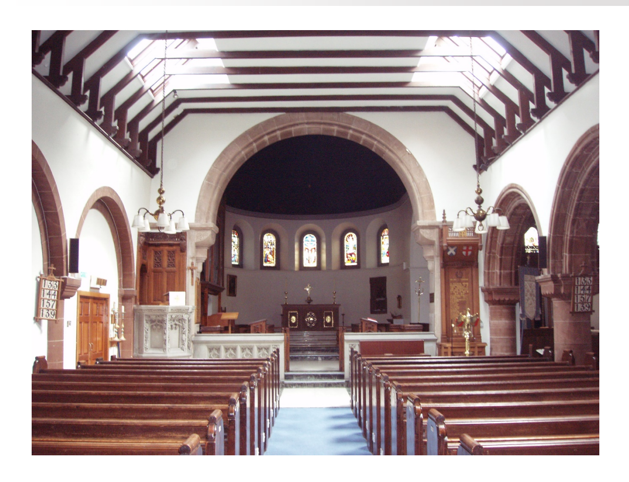
St Baldred's Episcopal Church, North Berwick