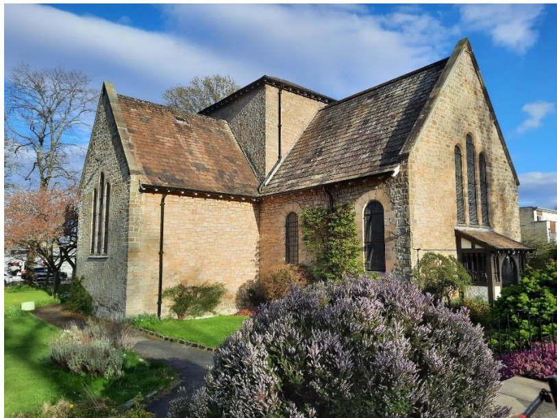
Church of the Holy Cross, Davidson's Mains, Edinburgh