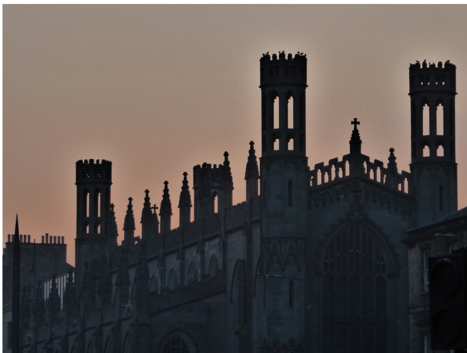
St Paul's & St George's Church, Edinburgh