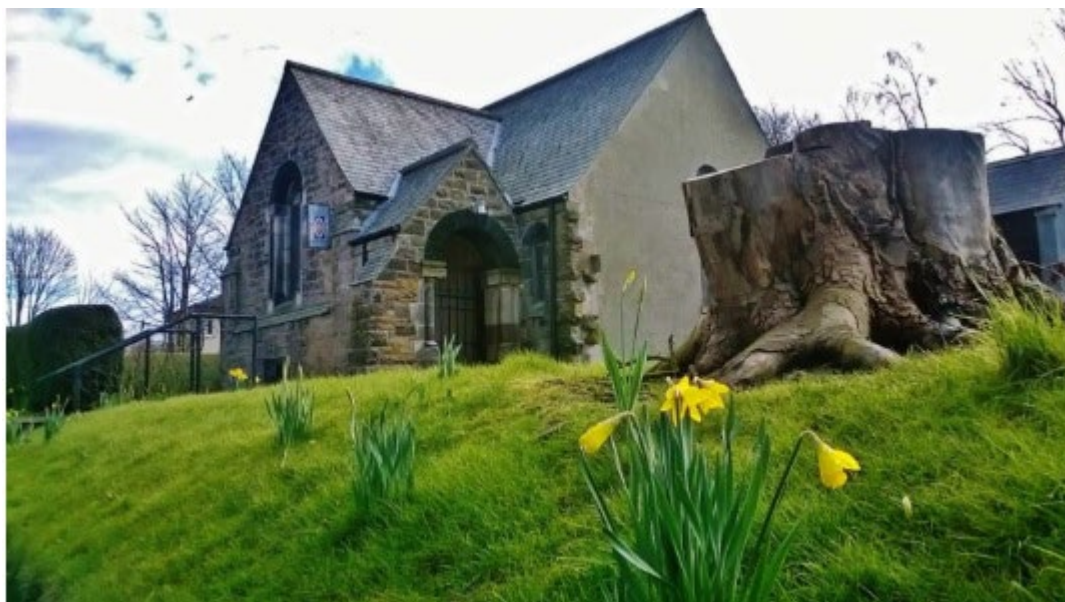
St Catharine's, Bo'ness