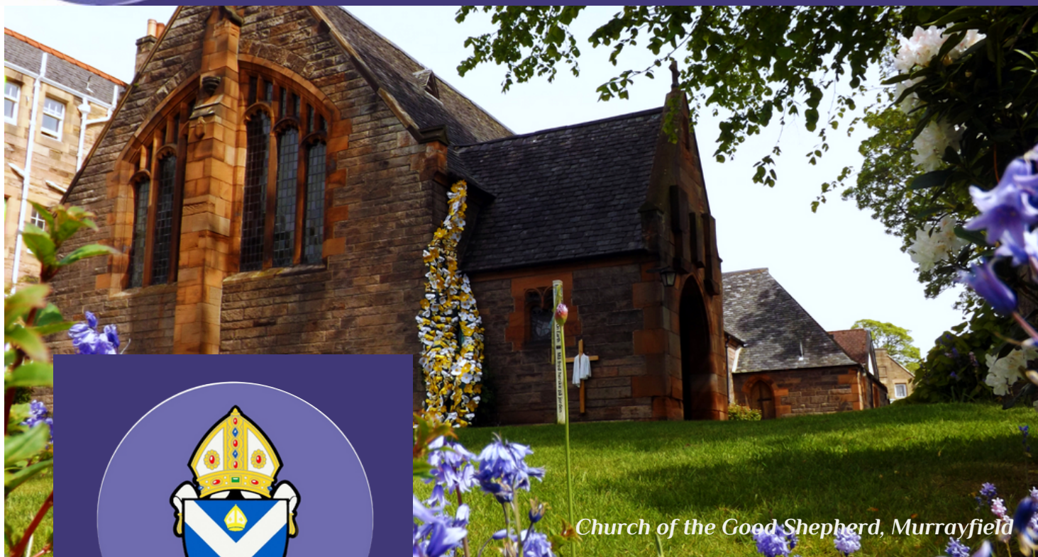
Church of the Good Shepherd, Murrayfield

Growing together in following Christ and sharing God's love