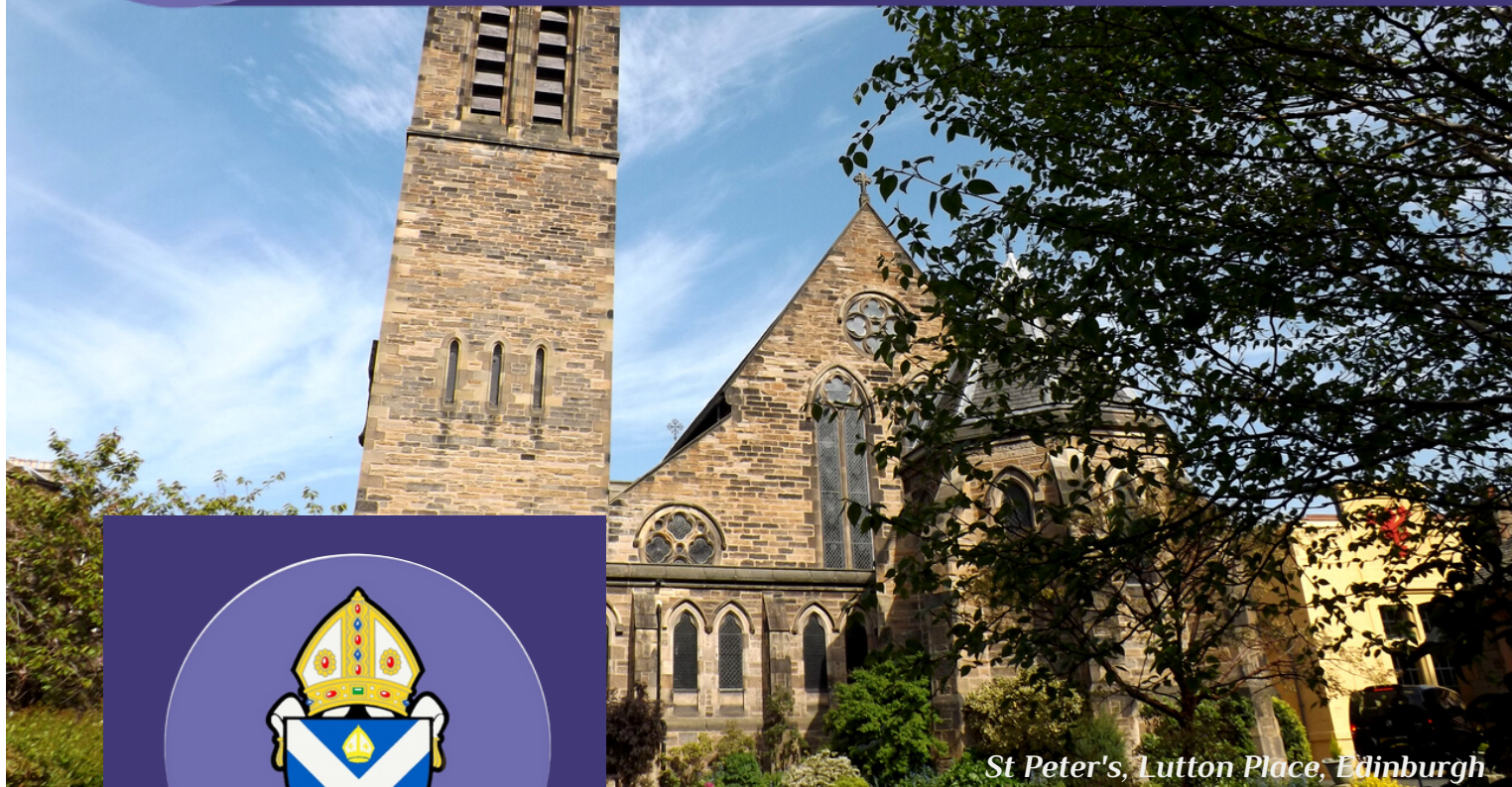
St Peter's, Lutton Place, Edinburgh

Growing together in following Christ and sharing God's love