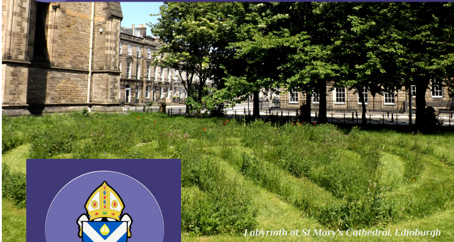
Labyrinth at St Mary's Cathedral, Edinburgh

Growing together in following Christ and sharing God's love