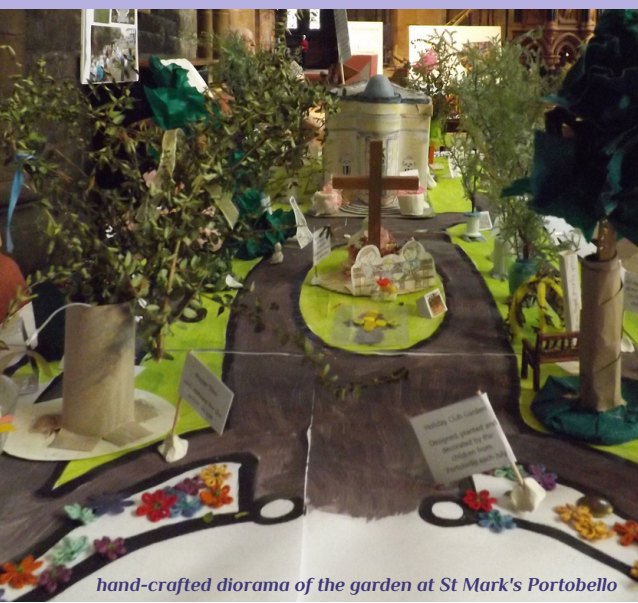
hand-crafted diorama of the garden at St Mark's Portobello

And we already have a date for the next BIG day! Save the date: Saturday 11 May 2024, St Mary's Cathedral, Edinburgh.