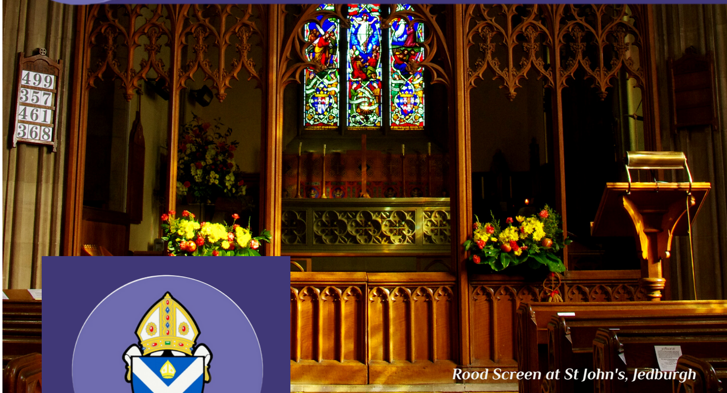
Rood Screen at St John's, Jedburgh

Growing together in following Christ and sharing God's love