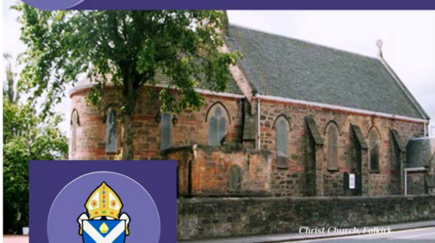
Christ Church, Falkirk

Growing together in following Christ and sharing God's love