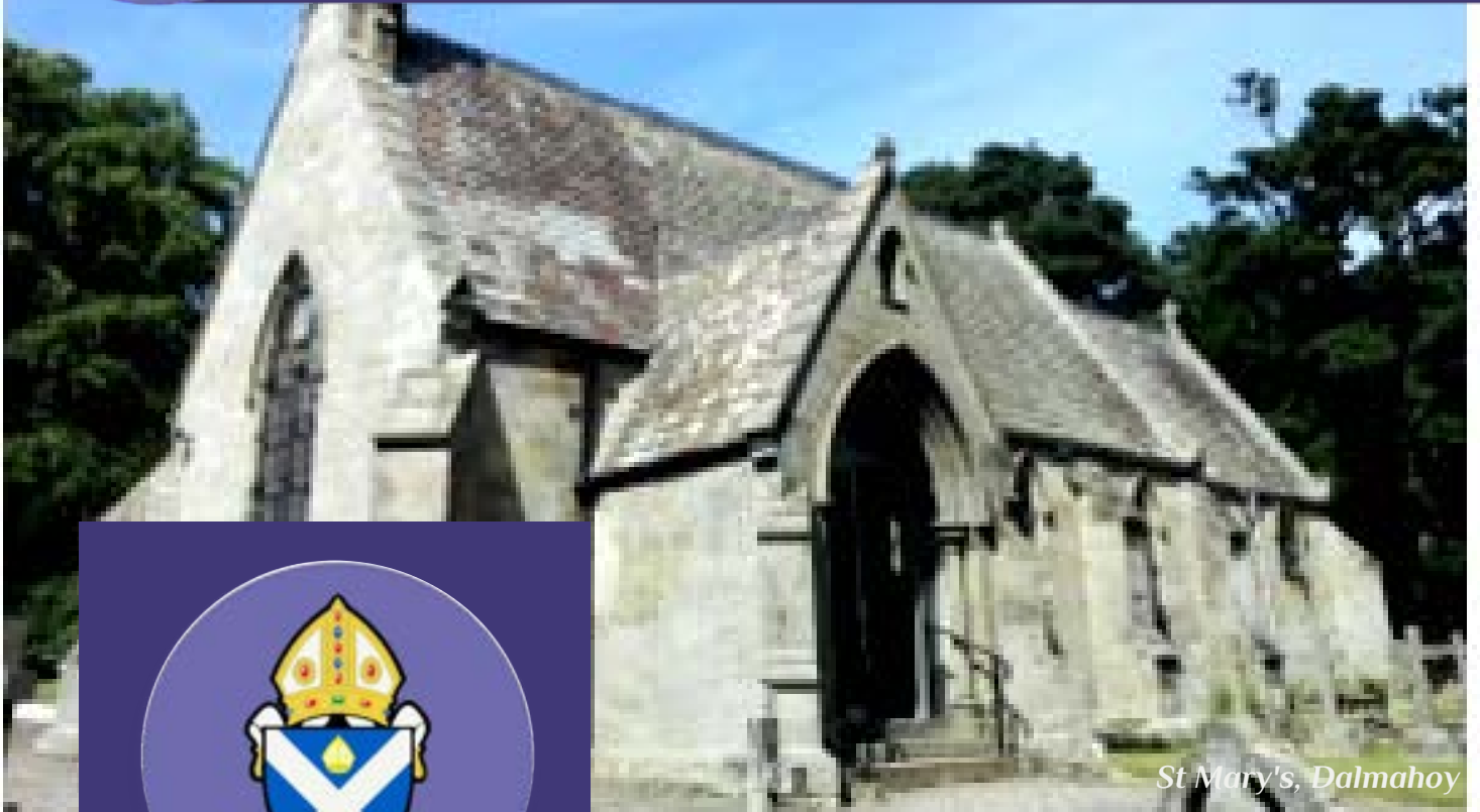
St Mary's, Dalmahoy

Growing together in following Christ and sharing God's love