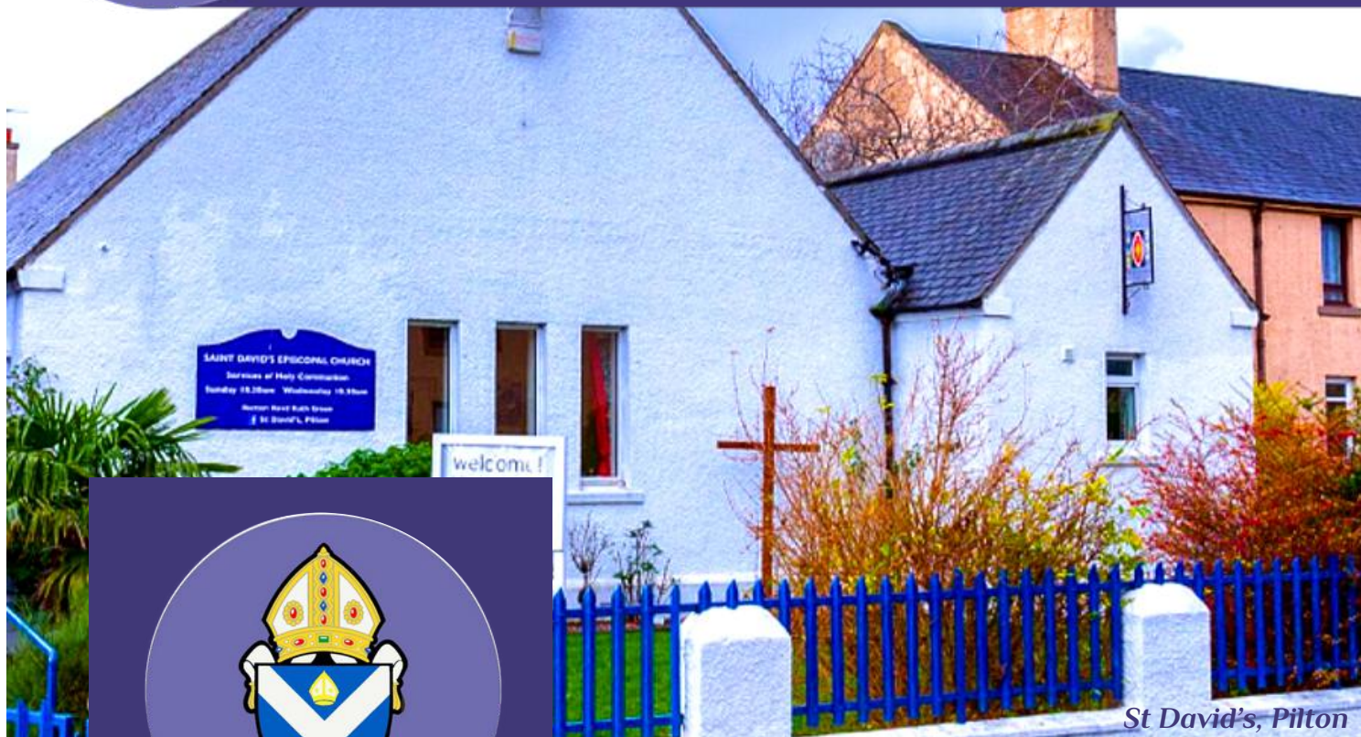
St David's, Pilton

Growing together in following Christ and sharing God's love