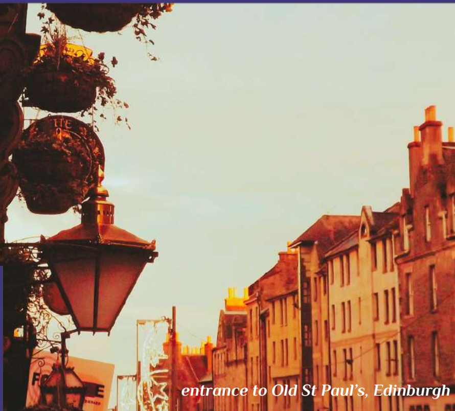
entrance to Old St Paul's, Edinburgh