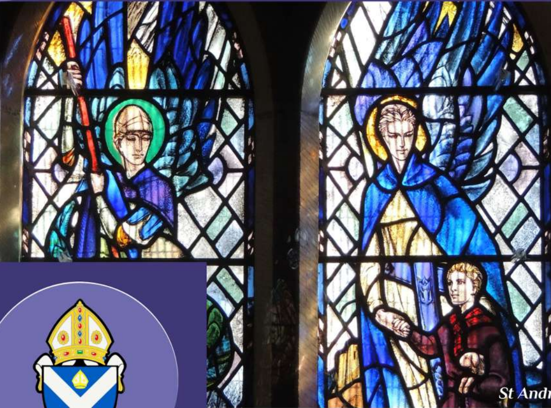
St Andrew's, Kelso

Growing together in following Christ and sharing God's love