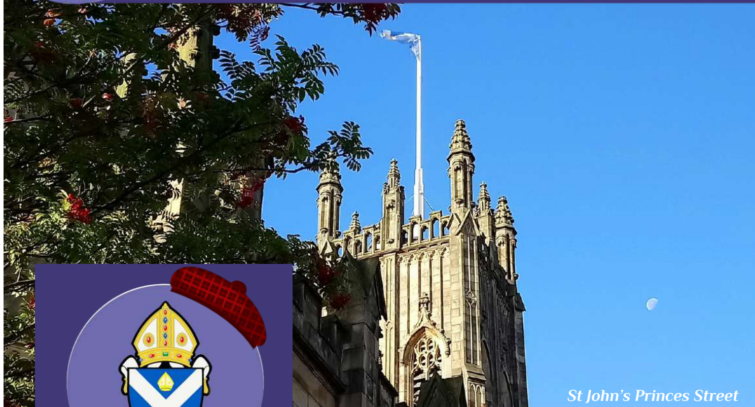
St John's Princes Street

Growing together in following Christ and sharing God's love