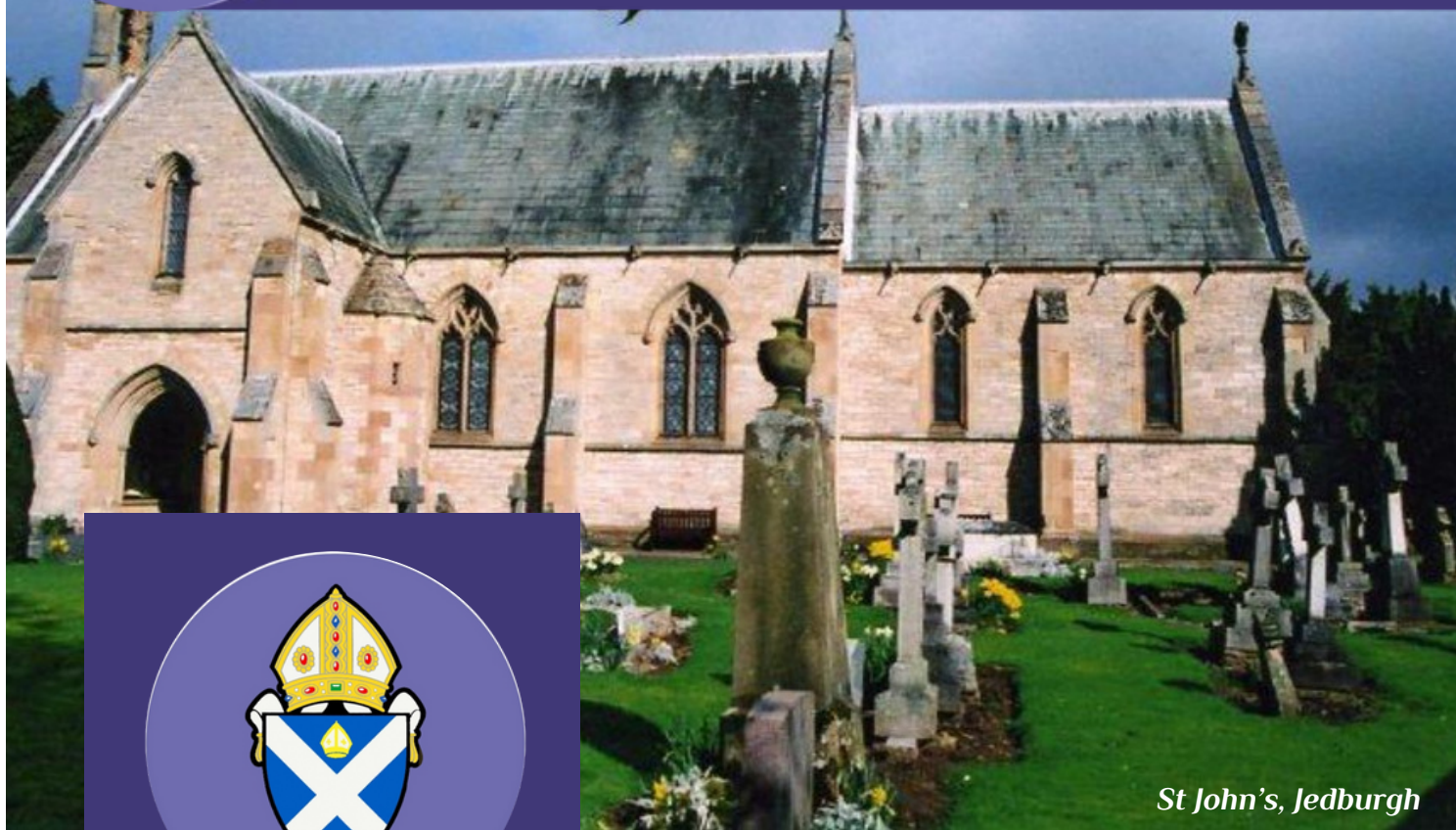
St John's, Jedburgh

Growing together in following Christ and sharing God's love