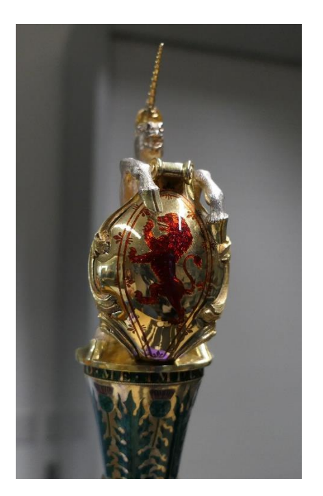
July 2023 July saw my visitation to St John's, Jedburgh.

The exhibition, entitled Unicorn , explores the cultural history of Scotland's national animal from antiquity to the present day.