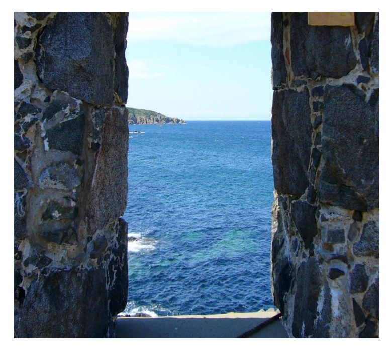
Offering bursaries for those in religious vocations seeking psychotherapy, counselling, or training.

Looking ahead to the immediate future, it's back to the reality – the blessings and the challenges - of the day to day. Bishop, members of Synod, this is my report.