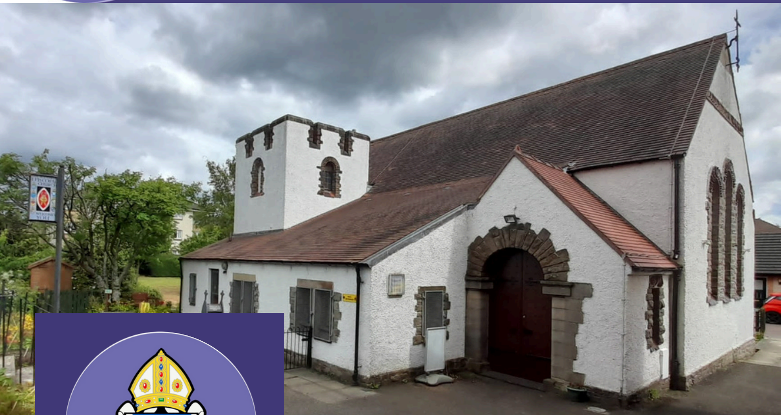
St Columba's Church, Bathgate