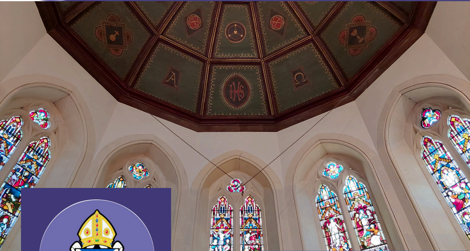
St Peter's Church, Lutton Place, Edinburgh