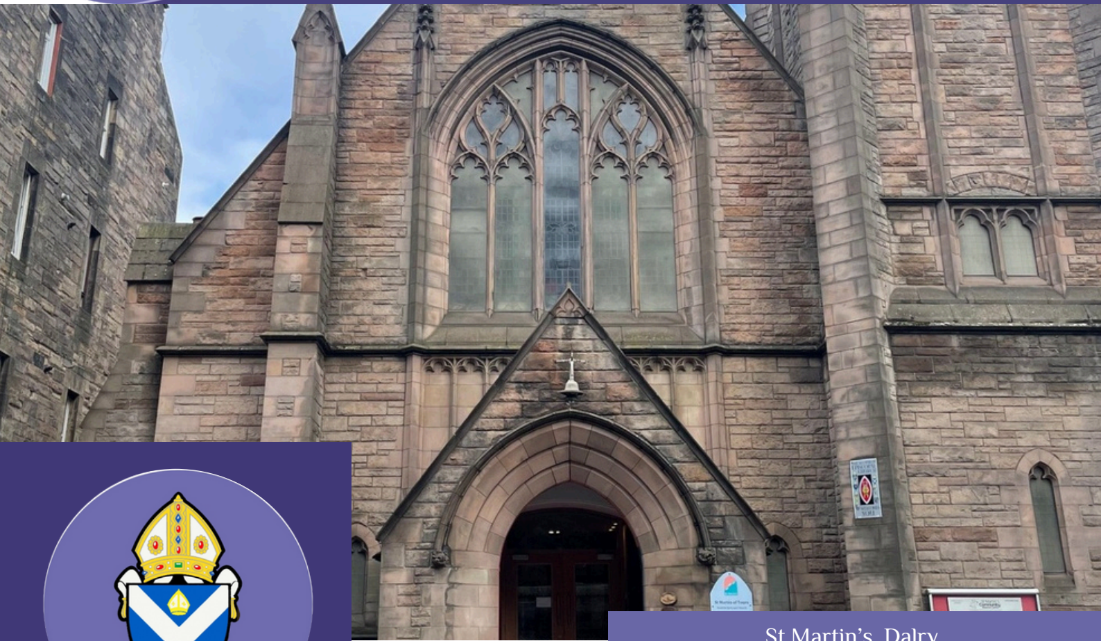
St Martin's, Dalry