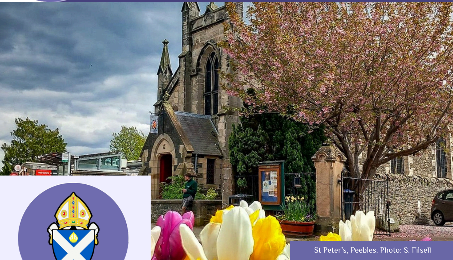
St Peter's, Peebles.